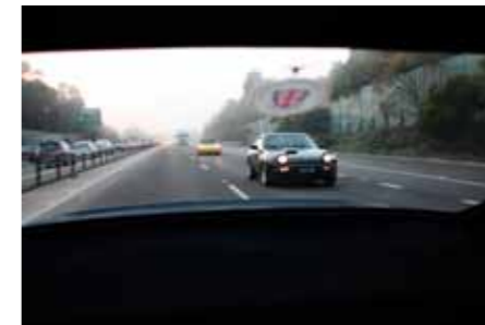
Keeping an eye on Craig