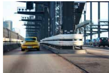
Accross the Coat Hanger