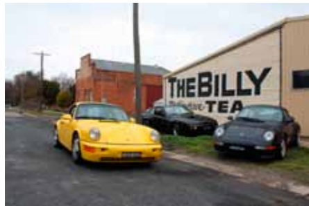
Any excuse for a Kodak moment