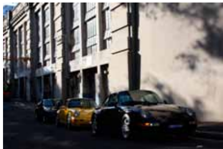
Last quick pic before we hit the road